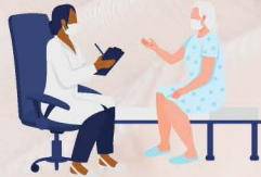
The Inevitable... Aging