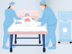
Recovery From Operations