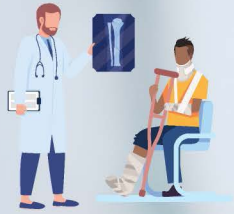
Accidents, Injuries & Fractures